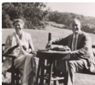
The Roosevelts at Hyde Park, NY