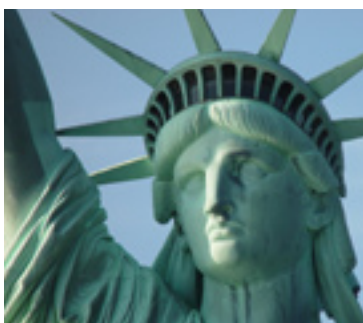
Discover Liberty!, Liberty Island

Additional cultural heritage projects at JCC&A include: Plans for outdoor exhibitions at Liberty Island for the National Park Service; exhibits and programs at Val-Kill, the Eleanor Roosevelt National Historic Site in Hyde Park, NY; and a new water park and playground at Hacienda Gardens at Dorado Beach in Puerto Rico.